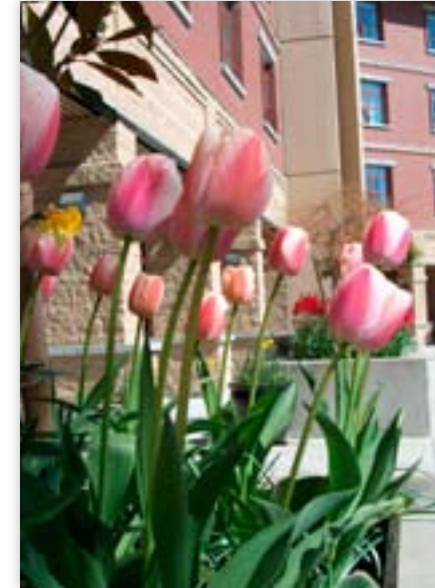
Spring time at Mount St. Mary is a rainbow of colour with over 3,200 tulips in bloom.

These kind donations have allowed us to replace worn tables, chairs, benches and garden umbrellas, plant dozens of new flower bulbs, and create wheelchair accessible planting pots for residents. The beautiful – and durable – new furniture will make the garden safe and accessible to residents and their guests all year round.