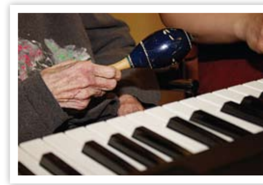
Music Therapy promotes and improves physical and mental health.