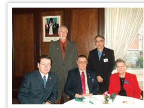
Members of the Knights of Columbus at the Mount St. Mary Foundation recognition event.